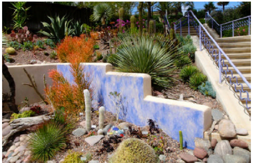
THE WATER CONSERVATION GARDEN

The biggest threat to El Cajon is the lack of water. The importance of saving water could not be more important today. The Water Conservation Garden is the best example that makes a difference in conserving water. I have learned from going there that you can have a nice yard and also use less water. That is the importance of saving water.