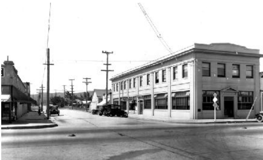
Cuyamaca State Bank was located at the southwest corner of Main and Magnolia in El Cajon in this photo taken in June 1924.