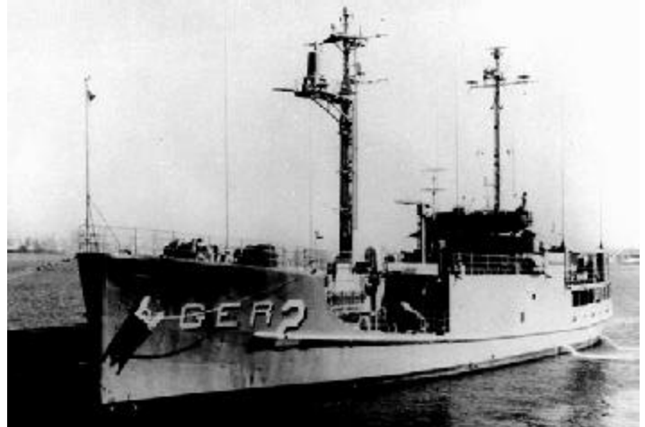
USS PUEBLO (AGER-2)