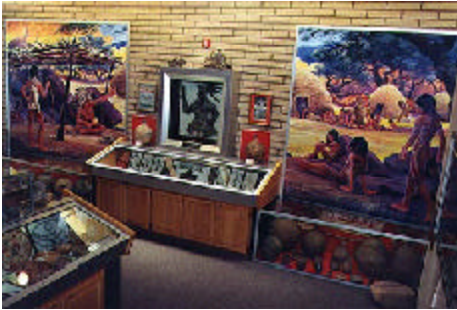
Tribal cultures are represented at the Heritage of the Americas Museum.