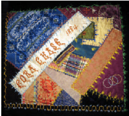
Quilt square with embroidered signature and date.

cotton employed for this showpiece is in the thread. The individual squares are bordered by black velvet or velveteen. Included with this great donation is a 13" x 17" pillowcase done in the same style.