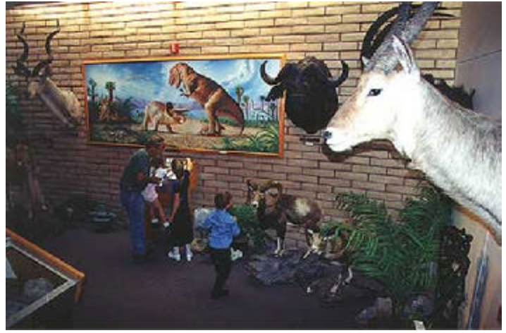
The Heritage of the Americas Museum is a cultural and educational center featuring the prehistoric and historic art, culture and natural history of the Americas.

The concept behind the museum is to take visitors on a journey through time. As they discover the past, their imaginations will be challenged, and they will be encouraged to further explore areas of interest at the major museums. Because of its relatively small size, the Heritage of the Americas Museum is not a competitive facility, but a supportive program for other county museums.