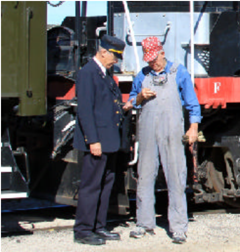
Comparing watches...yes, it's time for ECHS's annual meeting