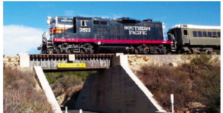
Engine No. 3873 crosses SR 94, five miles west of Campo, with museum's weekend train, the Golden State.

Typical of the many volunteer activities available at one or both of our venues includes serving as a crew member on our weekend vintage train journeys. Since we operate our trains on a public common-carrier rail line, crew volunteers are trained by the museum under the guidelines of the Federal Railroad Administration, just like the train crews on Amtrak and the thousands of commercial freight railroads throughout the U.S. Our crews are some of the best volunteer railroaders anywhere, and take great pride and satisfaction in doing their job to the best of their ability. All positions — speeder operator, Brakeman, Conductor and Locomotive Engineer — are available to any adult member, regardless of gender.