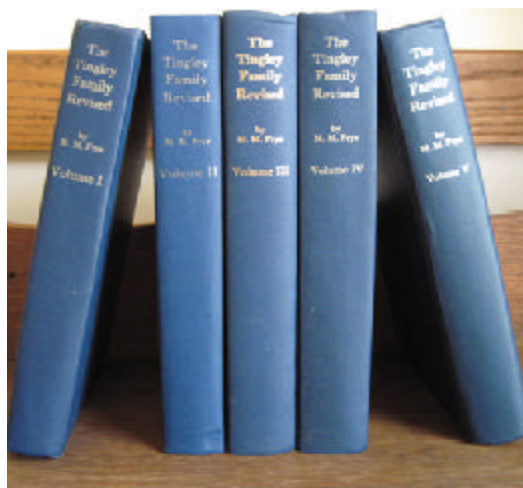
How much DNA might you share with these folks?