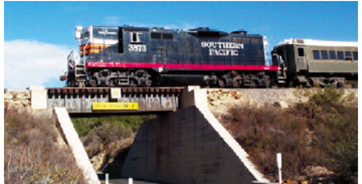
Engine No. 3873 crosses SR 94, five miles west of Campo, with museum's weekend train, the Golden State.

Typical of the many volunteer activities available at one or both of our venues includes serving as a crew member on our weekend vintage train journeys. Since we operate our trains on a public common-carrier rail line, crew volunteers are trained by the museum under the guidelines of the Federal Railroad Administration, just like the train crews on Amtrak and the thousands of commercial freight railroads throughout the U.S. Our crews are some of the best volunteer railroaders anywhere, and take great pride and satisfaction in doing their job to the best of their ability. All positions — speeder operator, Brakeman, Conductor and Locomotive Engineer — are available to any adult member, regardless of gender.