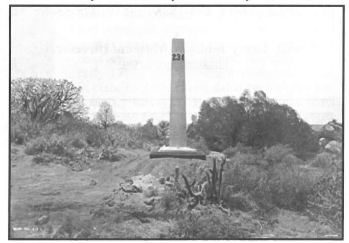
A west view of Monument 231 as photographed by D. R. Payne in 1894. It is located 5.5 miles east of Jacumba.

By the end of June, 1894, 256 of the 258 permanent monuments marking the land boundary between Mexico and the United States had been installed, and the remaining two (Nos. 255 and 258) were in place by August 1894. While a few were made of stone or masonry, most of the monuments were cast iron, either solid or cast in sections to make transporting them in difficult topography easier. These obelisks which were 6 1/2 feet tall and bolted to a 3 feet by 3 feet concrete base, weighed about 800 pounds and were cast in a foundry in El Paso, Texas. Each was photographed in place by D. R. Payne of Albuquerque, New Mexico. During the early 20th century, an